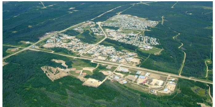
Aerial :Town of Swan Hills

The meeting took place at the Swan Hills Community Centre. Twenty Members participated